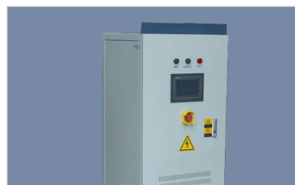
Industrial control equipment

11F, Block B, No. 19 of Jinxiu Mid Rd., Pingshan District, Shenzhen